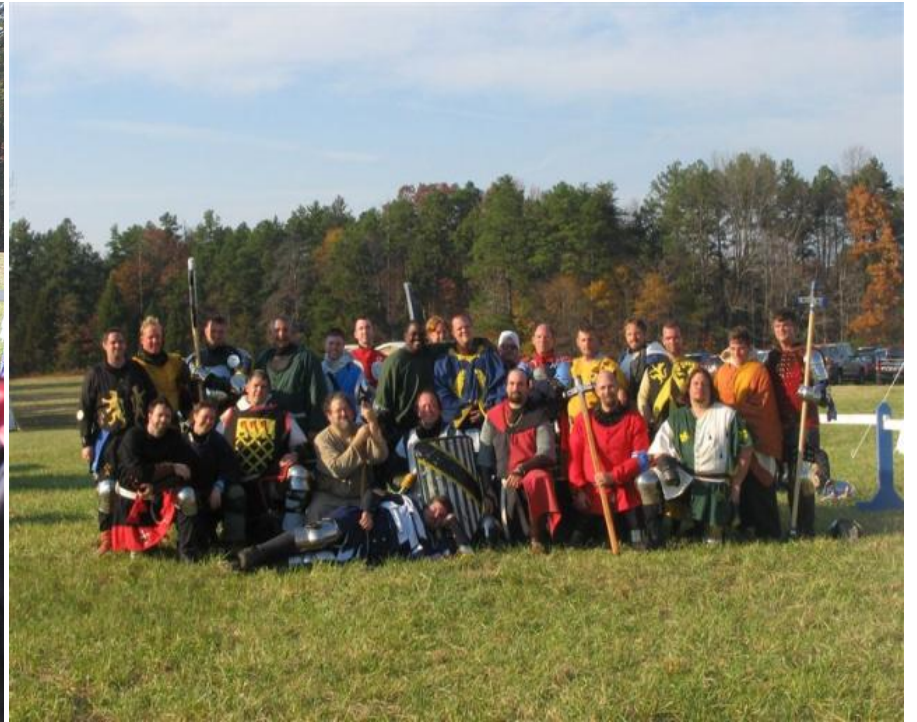
Le pas d'armes de l'Arbre d'or (Tournament of the Golden Tree) Windmaster's Hill, Atlantia November 2006